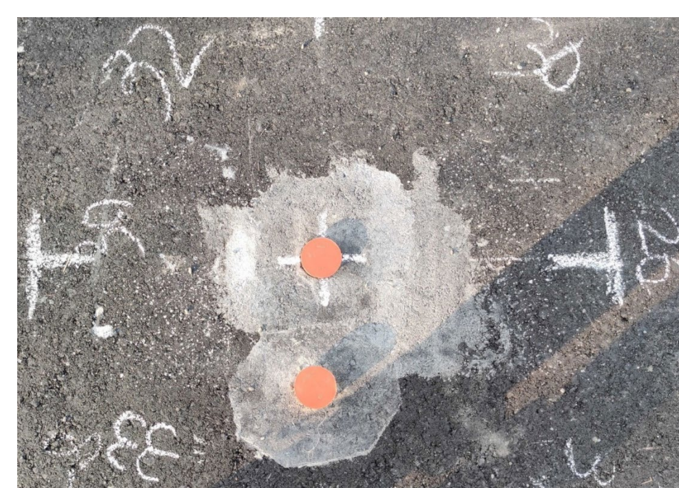
Simulated cavity under road surface