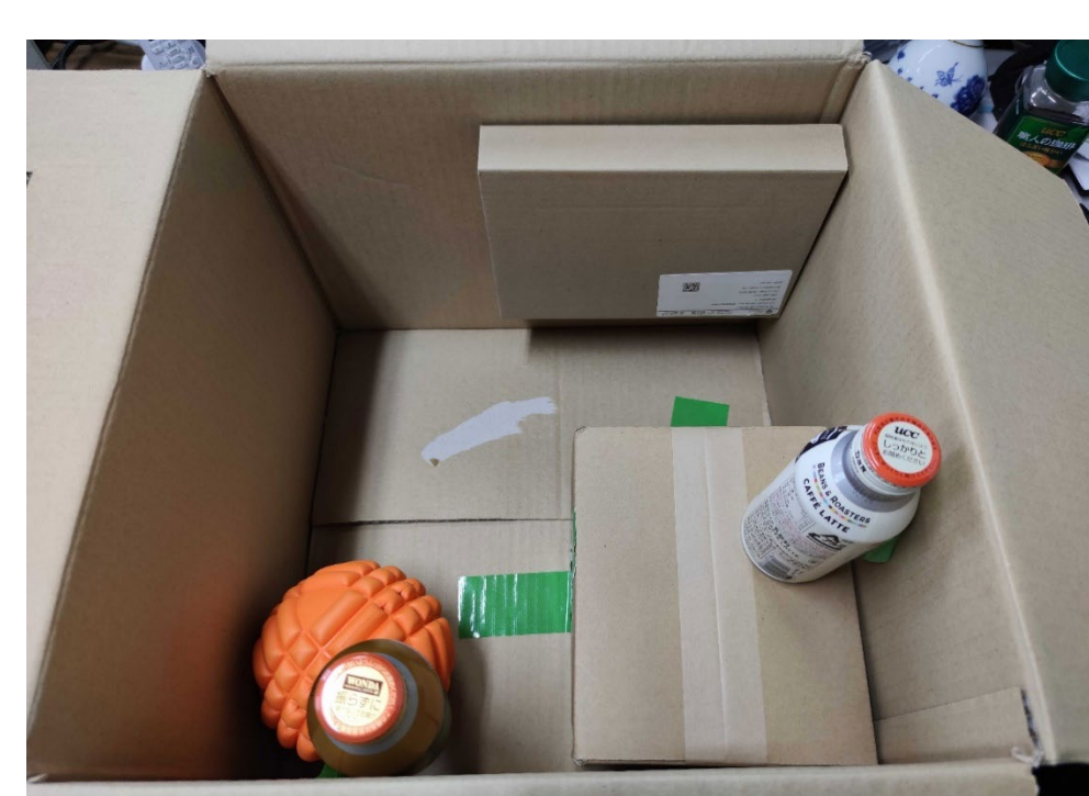
Various objects in cardboard box

Here is two example. The top one is the cardboard box that has some various objects (cardboard boxed, can, ball). The second is the handmade cavity under road surface. As you can see, the top result has good details, works well . The second result doesn't look quite good. It seems that this cavity had many unexpected object inside, because this cavity was handmade. LIDAR is just laser, so it is not good at an obstacle that is between sensor to the target object.