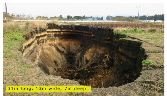
Sinkhole caused by internal erosion in volcanic "Shirasu" layer in Miyakonojo, Miyazaki (Sept. 2016)

By repetition of erosion and failure of cavity ceiling, a cavity moves upward